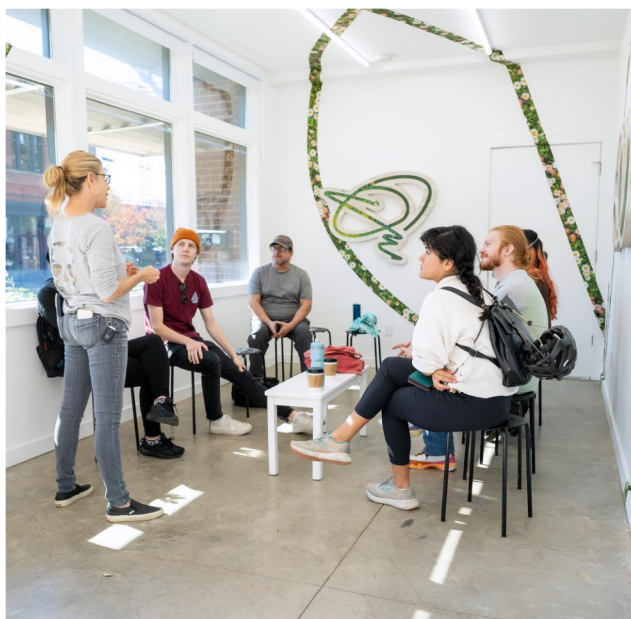
Georgia State University's Painting Class Meeting at the ACP Project Lab

Audience Spending: In 2023 ACP's audiences spent $1,864,424 in the local community based on data showing $38 per person average additional spending when attending in-person events.