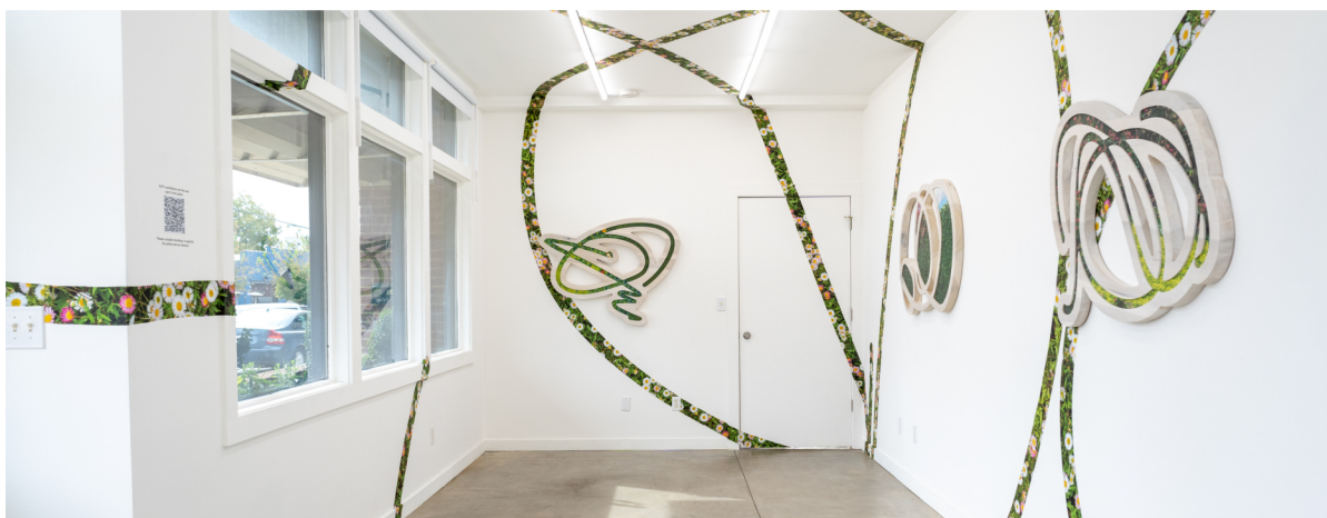
Installation view of Kalee Appleton: New Paths at the ACP Project Lab

“Atlanta Celebrates Photography today is a chapter. Atlanta Center for Photography is a book. It has longevity.”